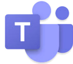
Microsoft Teams app